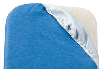
The Universal replacement cover fits ALL full size boards.