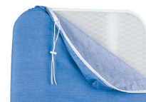
“The Basic” replacement cover fits most full size boards.