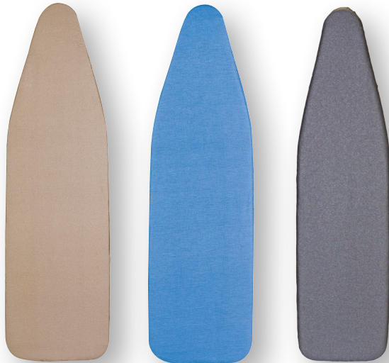
# CEFB11 # CEFB02 # CEFB21